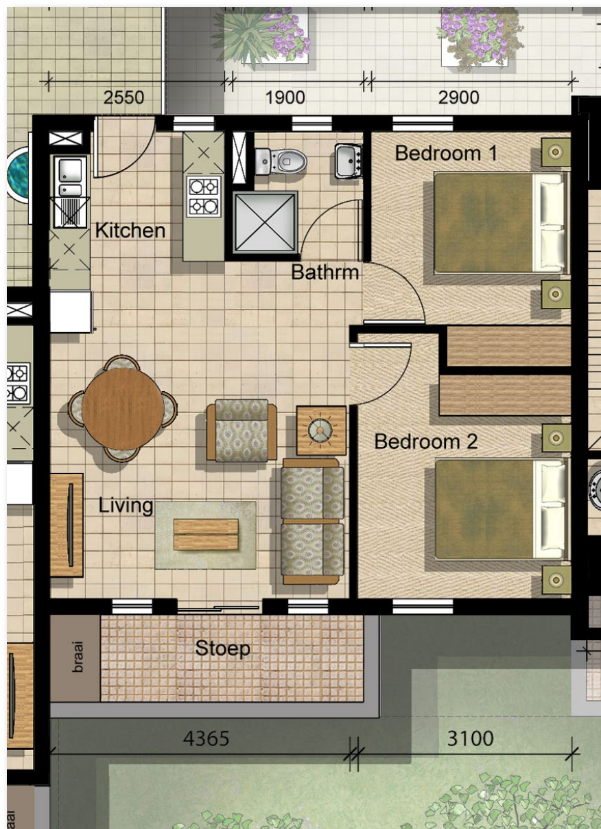
Unit Floor Plan